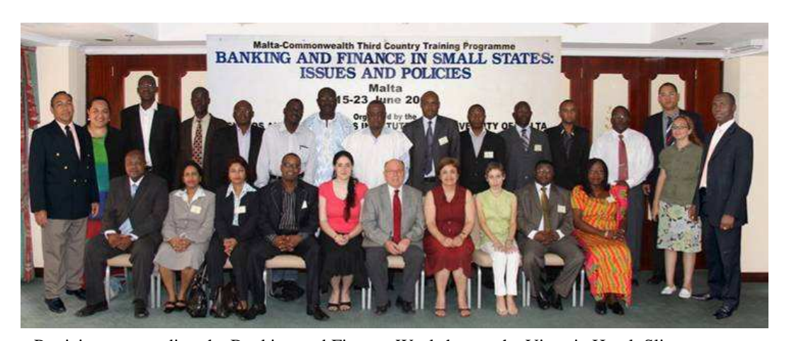
Participants attending the Banking and Finance Workshop at the Victoria Hotel, Sliema.

Between 15 and 23 June 2009, the Institute organized an international workshop entitled 'Banking and Finance in Small States' at the Victoria Hotel, Sliema. The workshop was a third country programme funded by the Commonwealth Secretariat, the Government of Malta and the respective government of the participants. A total of 22 international participants attended. The Workshop was spread over two weeks. It consisted mainly of presentations by resource persons on different aspects of the main theme and country presentations by the participants. In addition, field visits to various organizations were organised.