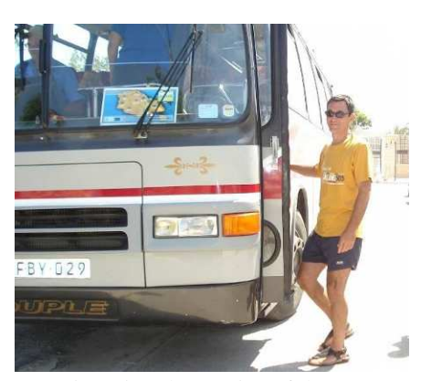
A tourist using the service of the Gozo Discovery Bus

pilot implementation of the project. The bus was scheduled to visit places of interest in Gozo, most of which cannot be reached by the public transport, and was in the form of a roll-on roll-off service, leaving the capital of Victoria every 2 hours. Two big billboards with the map of Gozo with photos of the places to be visited were placed in strategic places, one in Mgarr near the ferry and the other in Victoria. Posters, brochures and flyers were distributed all over the island, in hotels, restaurants, the Gozo Channel ferries and other places frequented by tourists. The bus could also be used by locals and the Maltese tourist.