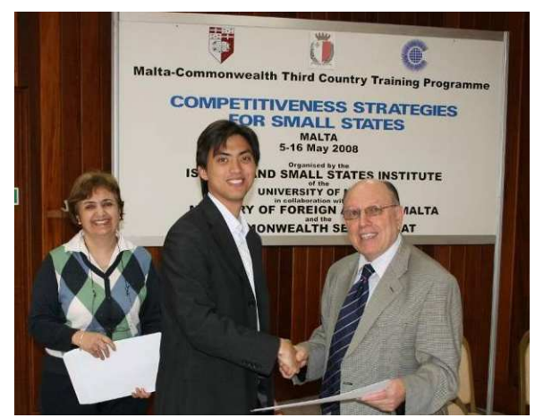
A participant being awarded a certificate of attendance at the end of the Commonwealth Workshop on Competitiveness Strategies for Small States.

The Training Workshop on Competitiveness Strategies for Small States held on 5-16 May 2008 was sponsored by the Commonwealth Fund for Technical Cooperation (CFTC) of the Commonwealth Secretariat, and the Malta Cooperation Programme Ministry Foreign Affairs. The programme, spread over two weeks, consisted mainly of presentations by resource persons on different aspects of the main theme and country presentations by the participants.