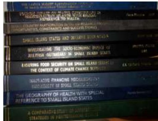
Dissertations submitted by the MA ISSS students in 2012