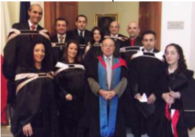
MA ISSS students and a PhD student graduating on 19 th November 2012 at the Jesuit's Church Valletta.