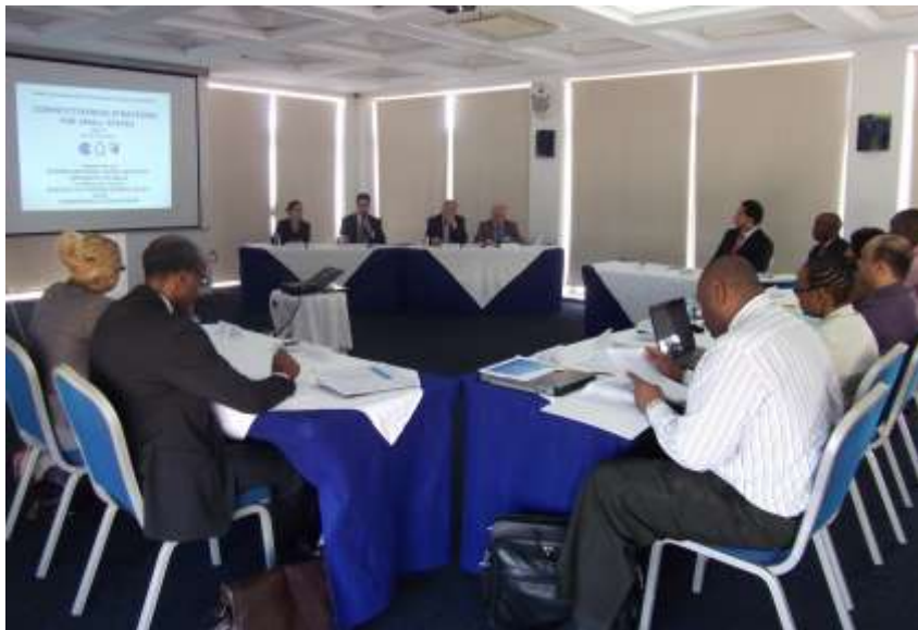
Participants at the Commonwealth Workshop on Competitiveness Strategies.

A total of 9 participants, hailing from different parts of the world, attended the workshop.