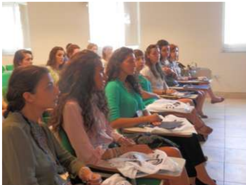
Participants at the International Summer School on Island Tourism

The institute was involved in the organisation of an international summer school on tourism management in small islands, in collaboration with Observatory on Tourism in the European Islands (OTIE). The summer school was held in Gozo between 28 th July and 6 th August. Further information is available at: http://www.otiesummerschool.com/program.html