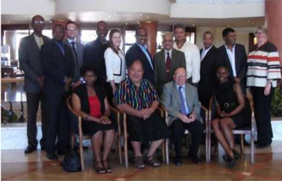
Participants and resource persons at the TWG workshop in June 2013