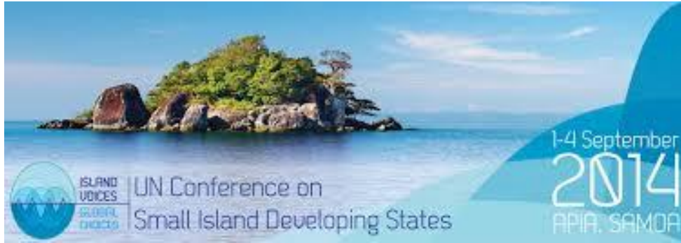
The Poster used for the UN Conference on Small Island Developing States, held in Samoa in September 2014.