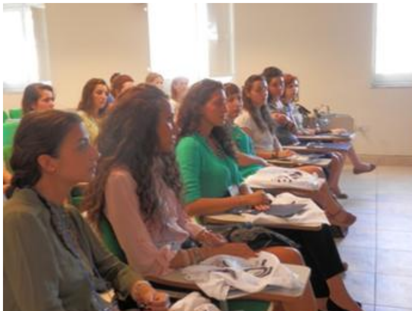
Participants at the International Summer School on Island Tourism

tourists. Further information is available at: http://www.otiesummerschool.com/program.html