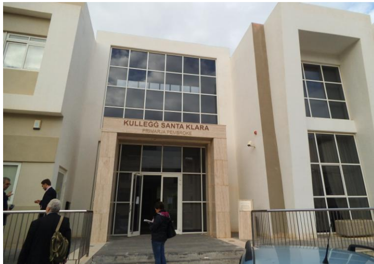
Students carrying out their fieldwork at Pembroke

As part of their studies students have to carry out regular fieldworks. In the latest visit during the academic year 2014- 2015 students visited the Santa Klara College, Pembroke to obtain practical knowledge relating to energy saving equipment used in the daily running of the school. These included a wind turbine, photovoltaic system and Solar water heaters. Following this visit, students also visited the WasteServe Malta Limited at Marsascala. After both visits students were asked to deliver a presentation on the efficiency of the equipment and what measures can be taken to improve.