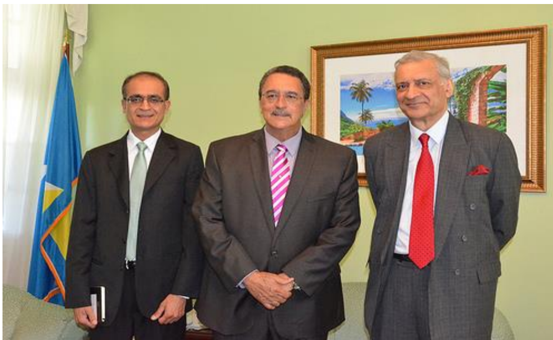
Commonwealth Secretary-General Kamalesh Sharma (right) and Commonwealth Deputy Secretary-General Deodat at the Third Global Biennial Conference on Small States.