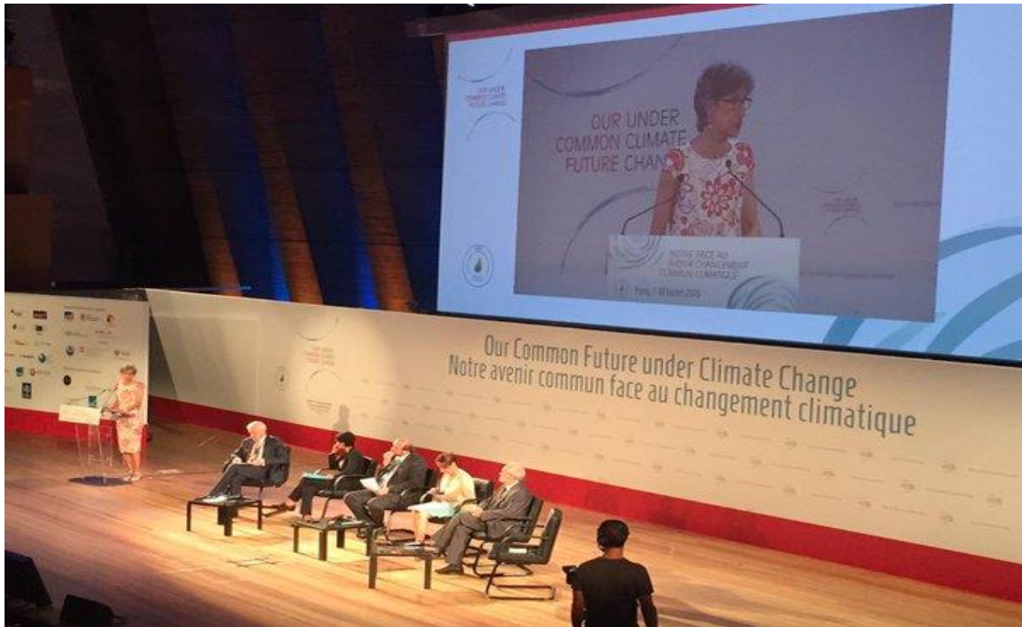
A session of the Climate change meeting in Paris.