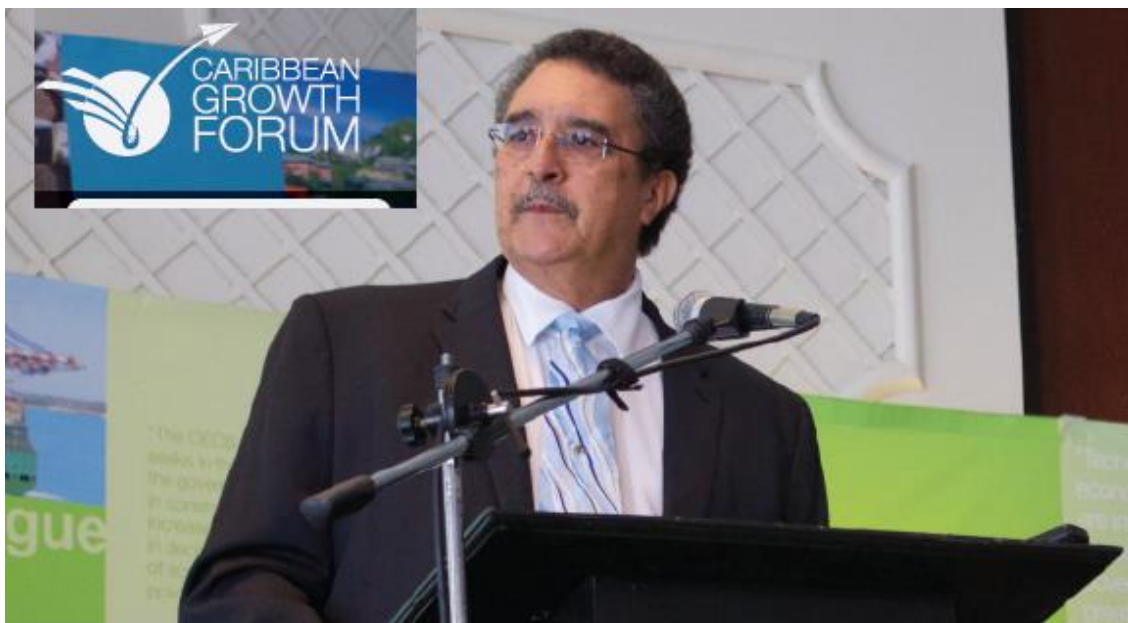
The Prime Minister of St Lucia addressing the Caribbean Growth Forum.

The “Caribbean Growth Forum” was organised by the World Bank in St Lucia in June 2015. Prof. Briguglio delivered a presentation on Competitiveness Strategies for Small States. This event brought together in Saint Lucia, Caribbean heads of state and over 200 government officials, private sector, civil society and development partners to discuss what are the new strategies and tools necessary to achieve growth in the Caribbean. More information is available at: http://caribgrowth.competecaribbean.org/