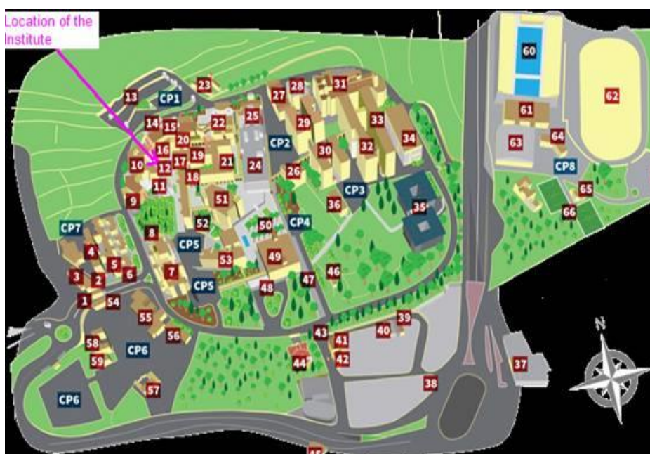
The Location of the Islands and Small States Institute.