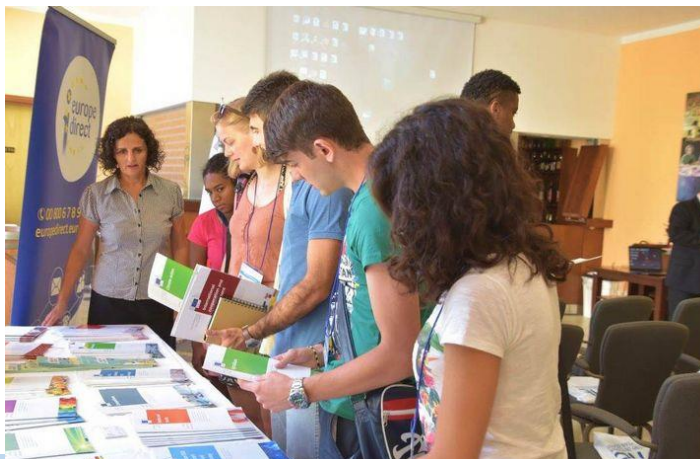
Participants at the 5 th Gozo OTIE Summer School viewing tourism brochures and information provided by Europe Direct Information Centre.

The Islands and Small States Institute collaborated with the Observatory on Tourism in the European Islands (OTIE) in the organization of the 5 th Gozo Summer School on “The challenges of Cultural tourism” held on 31 st July and 6 th August 2016 on the theme “Cultural Tourism Challenges in the European islands”.