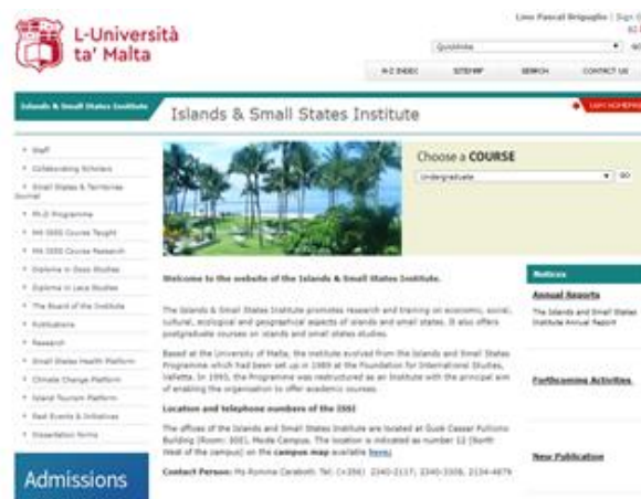
The Homepage of the website of the Islands and Small States Institute.