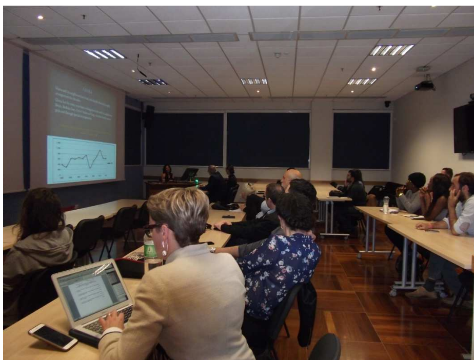
Participants attending the Climate Change Platform research seminar on 'Migration and Trade Patterns'.