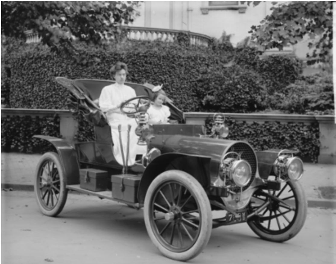
Figure 1: 1907 Franklin Model D roadster.

(Case 2) [22] and [23] and (Case 3) a patent [24], work accepted for publication [25], prolific author [26] and [27]. Other cites might contain ‘duplicate’ DOI and URLs (some SIAM articles) [28]. Multi-volume works as books [29] and [30]. A couple of citations with DOIs: [31, 28]. Online citations: [32, 18, 33, 34].