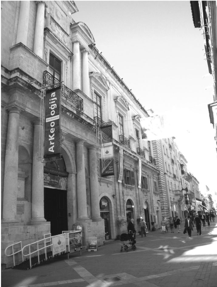
Figure 12.1. The National Museum of Archaeology.

care of their heritage, but also asked why Malta is without a museum, stating that: ‘such an institution is not a luxury; it is a necessity ... The idea that a museum is simply a store house of curiosities has long since been discarded.’ 3 A small part of the local collection was put together by the Maltese knight Giovanni