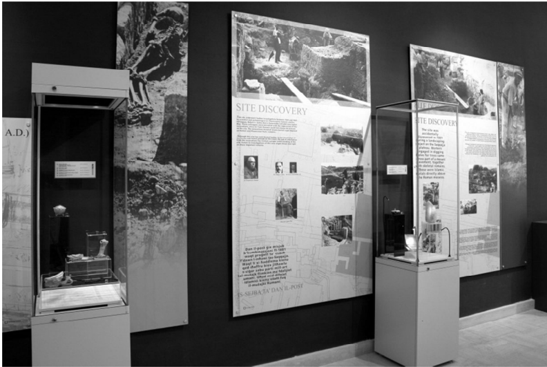
Figure 12.5. The interpretation panels at the Domus Romana.