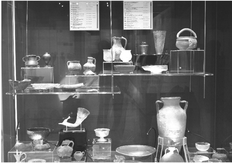
Figure 12.4. The display at the Domus Romana which was inaugurated in 2005.

things. They also pointed out that instructions are very important to help those who are not familiar with interactive equipment 12 .