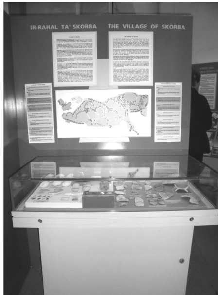
Figure 12.3. The display on the ground floor at the National Museum of Archaeology inaugurated in 1998.

remaining 7% associated museums with other places. This is the challenge that museums are faced with nowadays: to break away from the exclusively scholarly minded and able image that people often have of museums. To do this, museums need to move away from the concept of instruction for academics to a space in which the concept of edutainment (education and entertainment combined) is achieved. Museums also need to upgrade their display to meet visitor expectations, whilst enticing new audiences to visit museums as a most positive experience.