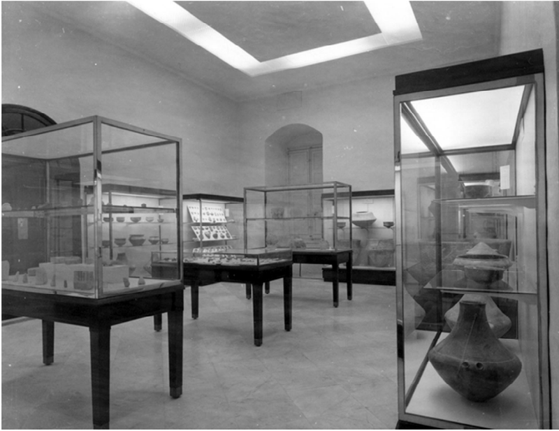
Figure 12.2. The display at the National Museum of Archaeology before 1995.

This brief overview on the development of museum displays gives us an idea why museums were, until quite recently, considered as “boring places” that one had to visit, most often on compulsory school trips. Bourdieu 6 , claims that the family in which a child is reared, influences the child’s future performance. Children who are exposed to museums are more likely to visit museums when they grow up. On the other hand, if a person visited a museum at a young age and had a negative experience, the likeliness is that the same person would not be inclined to visit museums as an adult. In a survey carried out in 1985 in Britain, 7 it was found that 35% of the people surveyed associated museums with libraries, 34% with monuments for the dead, 11% with schools, 10% with churches, and 3% with community centres; the