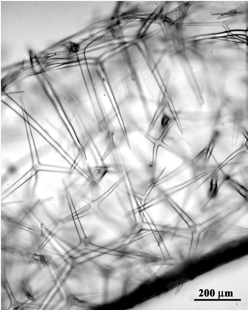
Fig. 2: Cross section of Paraleucilla magna from Marsaxlokk Bay, Malta, showing the skeletal architecture. (Image: C. Longo).

LONGO et al. (2007) considered Paraleucilla magna to be an alien species in the Mediterranean and suggested that bivalve aquaculture and shipping were the most probable vectors responsible for its spread. The reasons given by these authors were that (i) the genus Paraleucilla had never been recorded before in the Mediterranean Sea and that its distribution encompassed the Indo-Pacific and Red Sea; (ii) all the