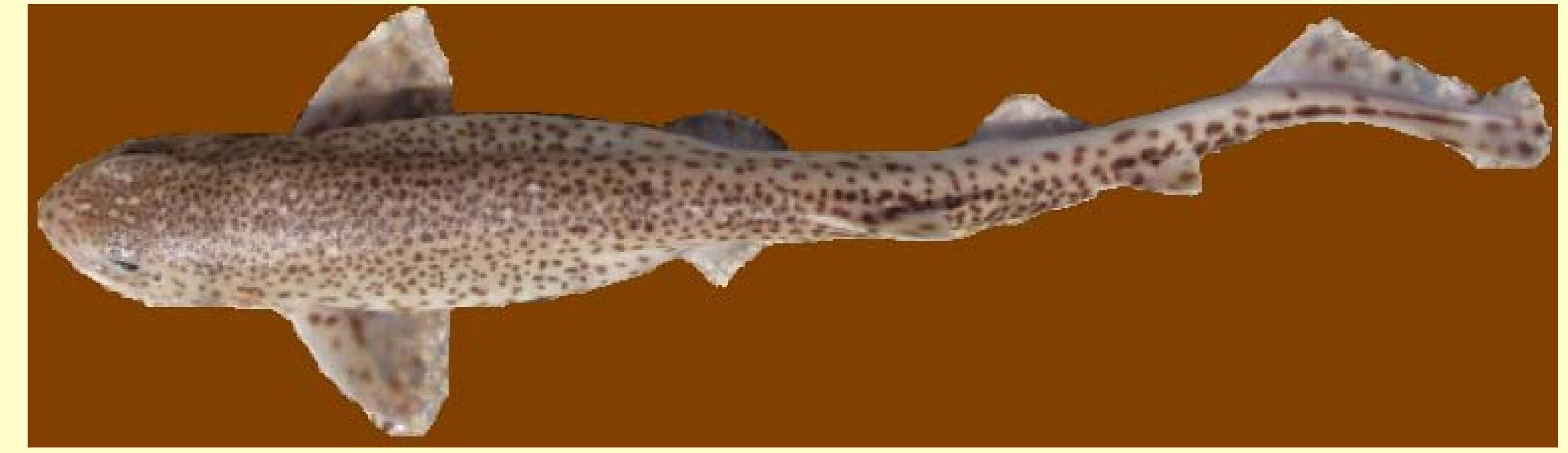
Fig.1. Scyliorhinus canicula

The catshark Scyliorhinus canicula (Fig.1) is a common demersal elasmobranch in the Mediterranean. It has a wide geographical and bathymetric distribution and is found primarily over sandy, muddy or gravelly bottoms [1]. Studies on the feeding habits have been made in various regions, but not in the Central Mediterranean. The present study addresses this gap by presenting information on the diet of the species for this region, for the first time.