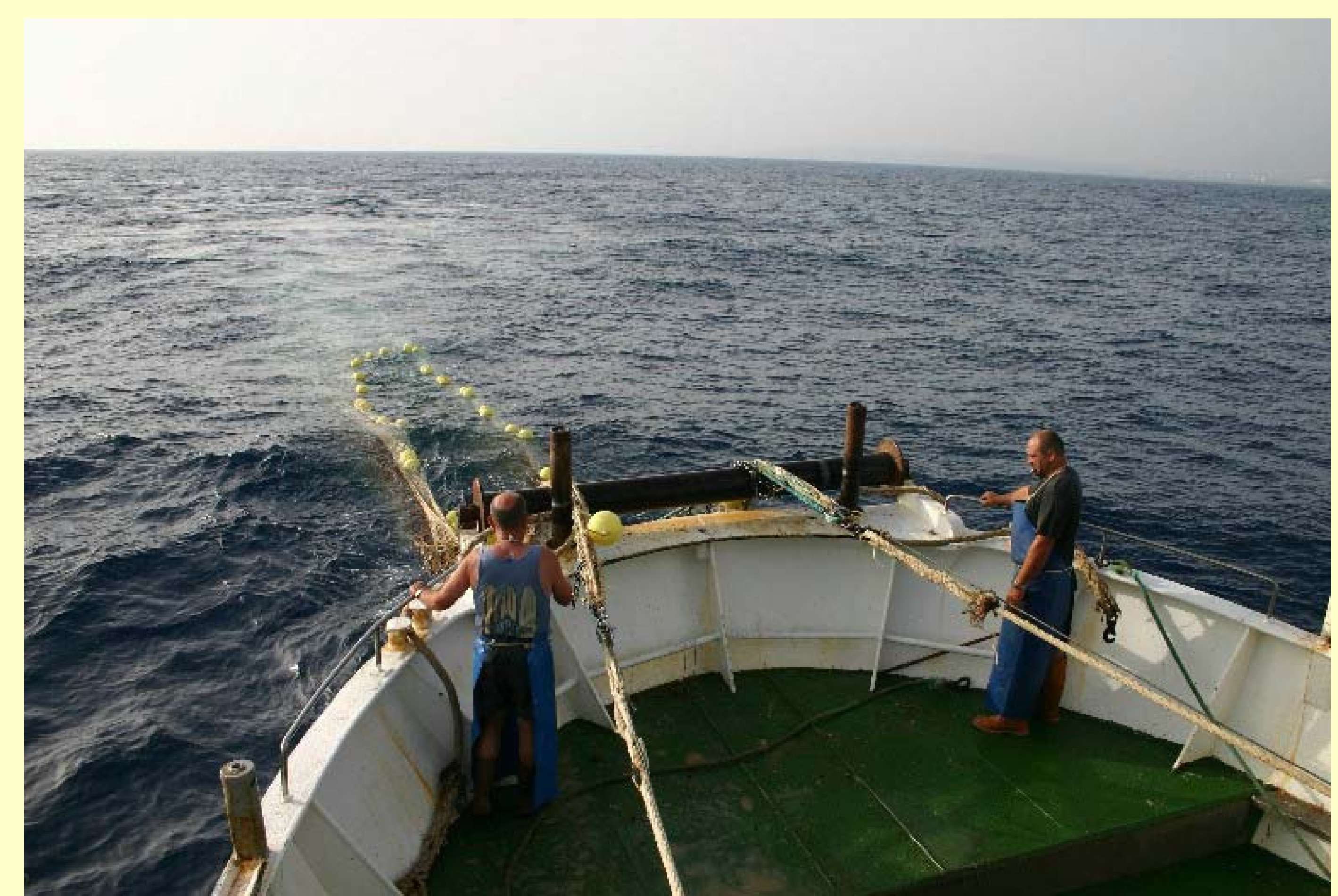
Fig. 3. Photograph showing the trawl net being hauled onboard the MV 'Sant' Anna'.