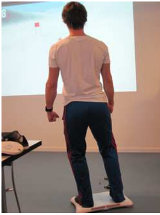
Figure 3: Control subject playing ReSkii.

ular the P^{left} value calculated during the previous section will determine the distance D^{left} between the right and left gates while the corresponding P^{right} value will determine the distance D^{right} as follows: