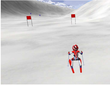
Figure 1: A screenshot of the ReSkii game.