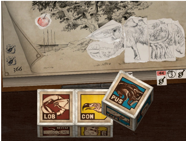
Figure 1. A screenshot of ‘Gua-Le-Ni; or, The Horrendous Parade’

As part of its biometrics-guided tuning and design iterations, the ‘Gua-Le-Ni’ videogame underwent two consecutive sessions of psychophysiological measurements. From a game design perspective, the two separated sets of experiments were aimed at tackling particular aspects of the game which had a specific hierarchy and relevance within the time line of its design iterations. Consequently, in order to be effectively applicable to the design process, dedicated tests needed to be run in specific phases of the design process.