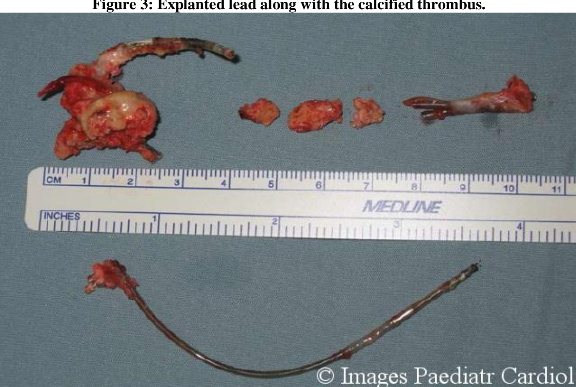
Figure 3: Explanted lead along with the calcified thrombus.

The case was discussed at cardiac surgery conference and one week later she went to the operating room for a right atrial thrombectomy, primary closure of the PFO, and conversion to an epicardial pacing system. Intraoperative inspection within the RA showed the atrial and ventricular pacing leads surrounded by a calcified thrombus measuring 3 x 2 cm (Figure 3). Complete surgical extraction was performed along with successful placement of the epicardial pacing system. The patient's hospital course was complicated by a mild left-sided pleural effusion which resolved on diuretics. On follow-up 4 months post-operatively the patient had resolution of dizziness and fatigue. She had normal resting oxygen saturations and TTE showed normal tricuspid inflow and no recurrence of thrombus.