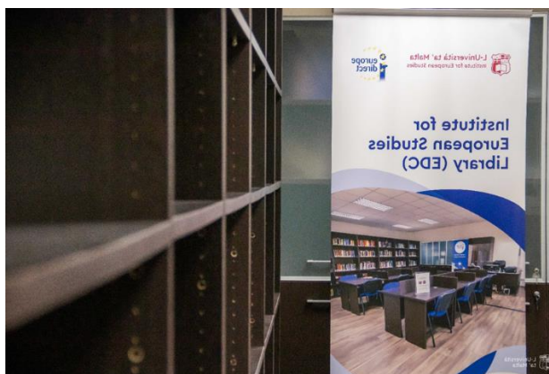
The Institute Library banner