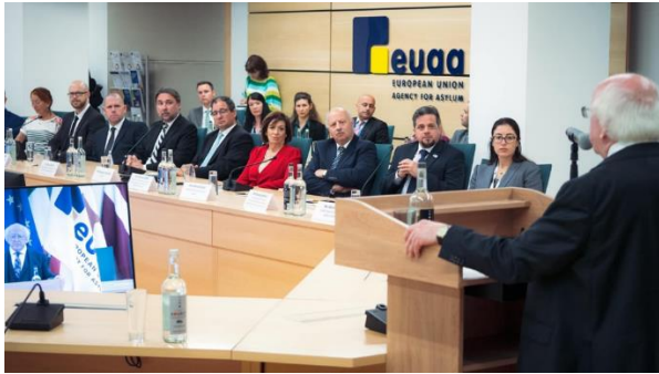
The University delegates listening to the Irish President