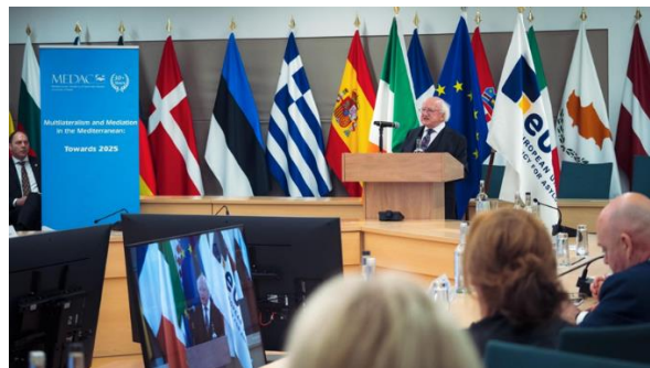
The Irish President speaking at the event