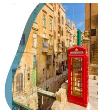
The poster of the event