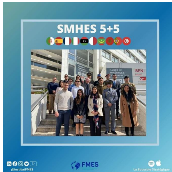
Participants of the event