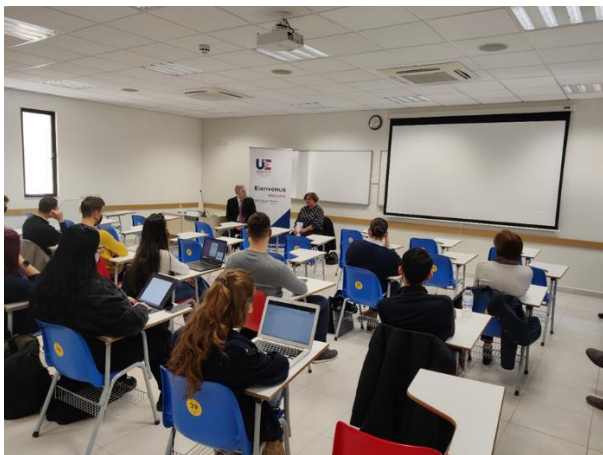
The French Ambassador speaking to students during the event