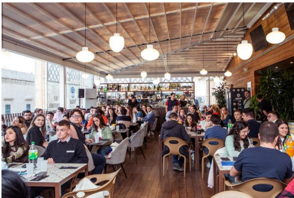
Students attending the event as well as the winning team