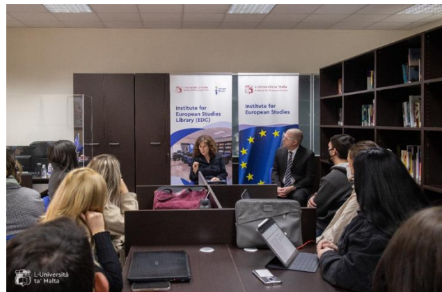
The British High Commissioner speaking to the students

The High Commissioner noted that Malta and the UK are engaged in close cooperation given that they are numerous Maltese residing in the UK and the latter is of great importance for Malta given that it is a popular tourist destination. In addition, the High Commissioner stated that given the special relationship between Malta and the UK, the two sides are able to meet and discuss important issues. The session ended with a Q&A with students currently enrolled in their undergraduate and postgraduate degrees.