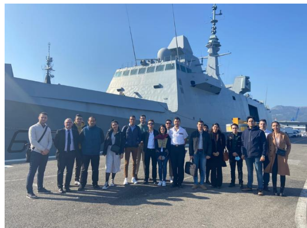
Activities organized as part of the training session