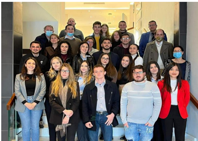
Photo of students and staff at the Theses Workshop

The Theses Workshop was held on 16 February at the Paradise Bay Hotel in Cirkewwa. Twenty-one students presented an overview of their work with the academic staff providing feedback. The Workshop went well and student feedback was very positive.