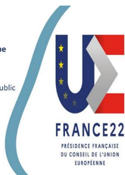
The poster of the event