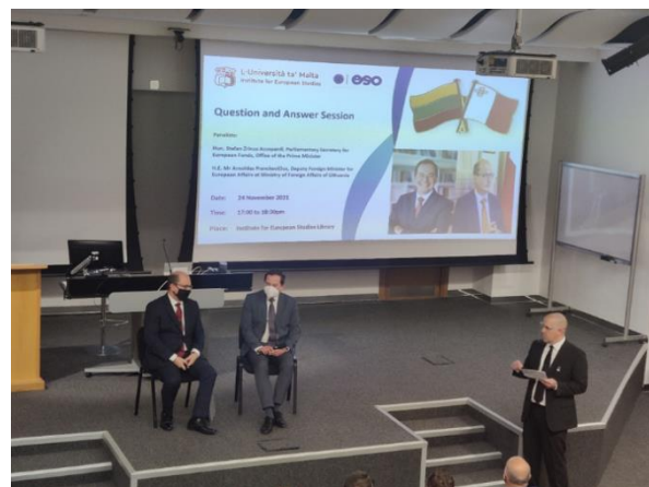
Prof Harwood moderating the panel discussion with H.E. Pranckevicius and the Hon. Azzopardi Zrinzo

The Deputy Foreign Minister of Lithuania, H.E. Arnoldas Pranckevicius, also spoke about the tensions in Sino-Lithuanian relations after Lithuania allowed Taiwan to open an office in Lithuania. Both Ministers also spoke at length about the challenges posed by irregular migration and the need for greater EU assistance in dealing with this issue. The European Students Organisation and JEF helped the Institute in the organisation of this event.