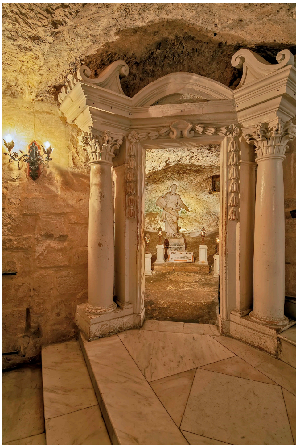
Figure 4. Saint Paul's Grotto, Rabat Malta (Daniel Cilia).

In 2013, as part of the refurbishment of the nearby Wignacourt Museum, a new access arrangement to the grotto was introduced. Access through the church of Saint Publius and down the monumental staircase was barred, and the church door kept closed. On most days, the grotto became accessible only through the museum entrance across the road, even for those wishing to visit the grotto for devotional purposes, who are granted free admission. This issue will be returned to in the discussion at the end of this paper.