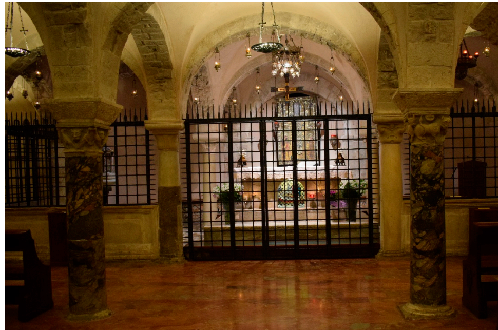
Figure 1. Crypt below main altar, Basilica of Saint Nicholas of Bari.

The case of the crypt of Saint Nicholas provides a remarkable example of how a hydrological phenomenon may acquire major symbolic significance for a community, giving rise to an elaborate ritual which is still carefully observed each year. The crypt in the Basilica, where the body of the saint is buried, stands a few metres away from the shoreline, and its floor is very close to the present-day sea level. Figure 1 shows a general view of the crypt, with the tomb of Saint Nicholas at the centre.