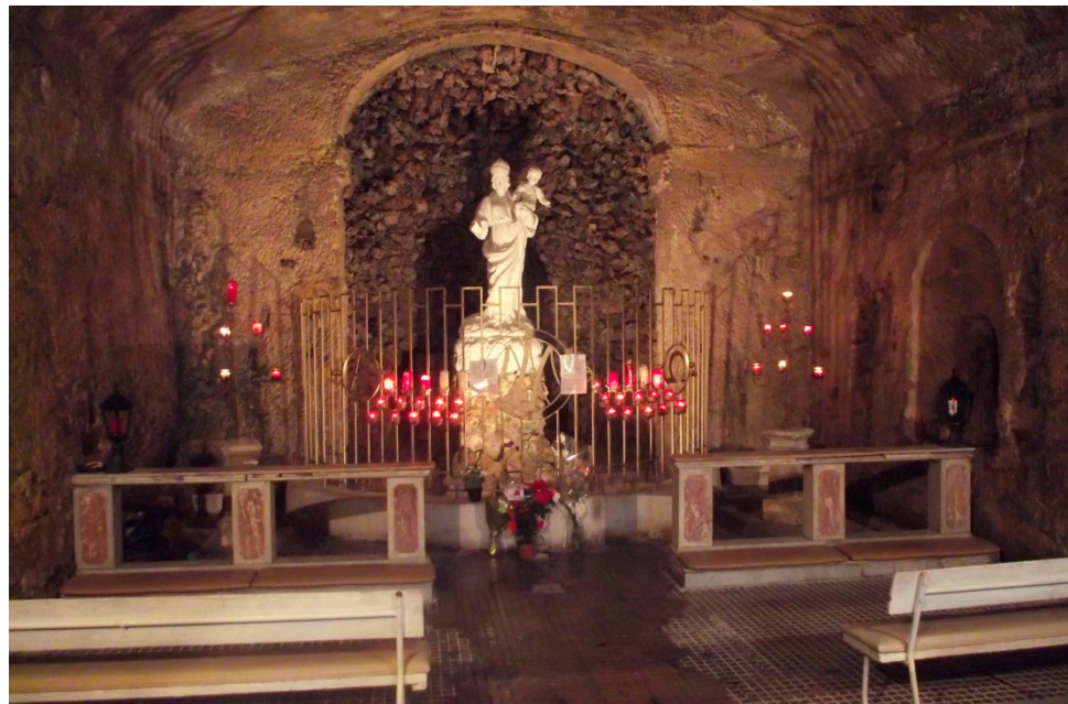
Figure 2. Grotto of the Sanctuary of 'Our Lady of the Grotto', Mellieħa, Malta (Author).

Figure 2 shows the cult statue of the Virgin Mary standing on a pedestal in a basin that is filled with water from an underground spring. Popular beliefs regarding the supernatural properties of the statue and the site abound among the local community [30] (pp. 174–175). These include the conviction that water from this source has healing properties. In the mid-twentieth century, a folklorist recorded that '... people still go there to drink of its healing waters' [30] (p. 174), and the site is still deeply venerated today.