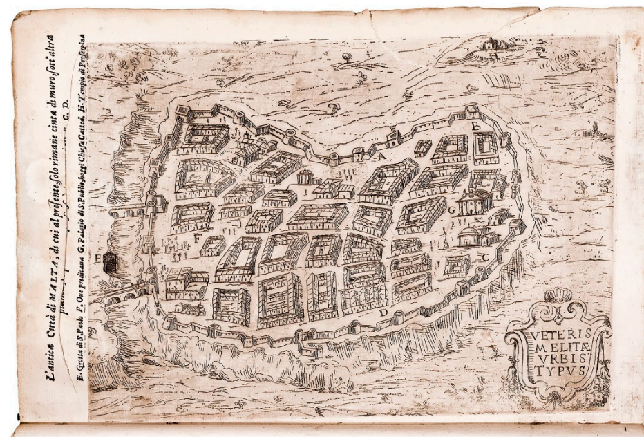
Figure 3. Archaeological reconstruction of the ancient town of Melite, by Giovanni Francesco Abela. Saint Paul's Grotto is prominently shown in the side of the ditch, to the left [33].

In the early seventeenth century, a monumental sanctuary complex was built around this underground grotto by the Grand Master of the Knights of Saint John, Alof de Wignacourt, to celebrate the cult of the famous saint, which began to attract a growing number of pilgrims from across Europe [34]. The site and the cult continued to receive further embellishment by his successors, including the church dedicated to Saint Publius, directly over the grotto, to which it is connected by a magnificent monumental staircase. Throughout these developments, the site has remained a focus of intense devotion for the native Maltese population. Saint Paul was not only the patron of this church and this parish, but is venerated as the patron and protector of the entire island, and is inseparable from the identity of the Maltese population [35,36].