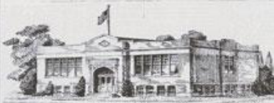
The school building which is to be erected on the corner of 10th and Main streets.

The school board has been successful in selling the bonds for the school building. The bonds were sold at a premium and the school board is very pleased with the result. The bonds will be used to pay for the construction of the building.