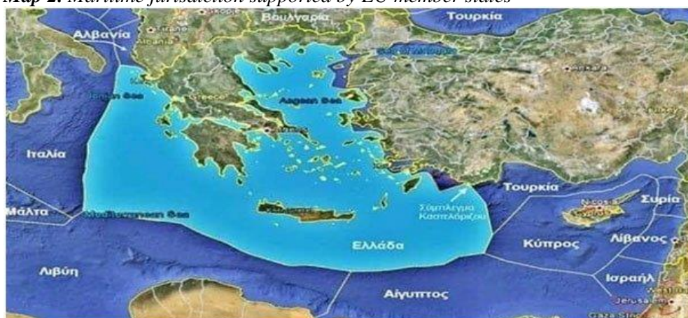
Map 2. Maritime jurisdiction supported by EU member states