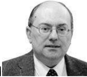
Maladministration at its best ... but