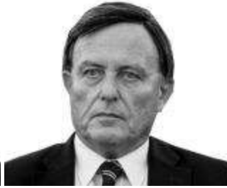
What's done well, done badly