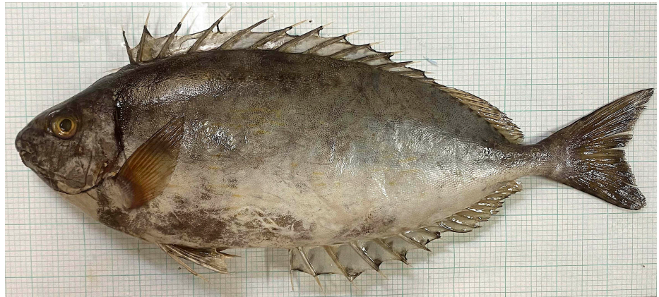
Figure 1. The first recorded Siganus rivulatus specimen caught from Malta in July 2022.