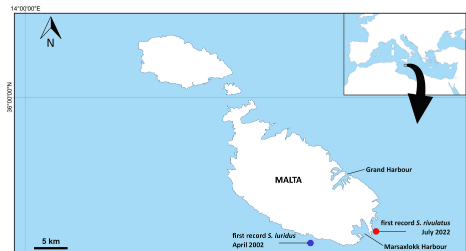
Figure 2. A map showing the location from where the first records of Siganus luridus (blue) and Siganus rivulatus (red) were collected.