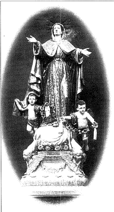
L-istatwa titolari l-antika ta' Santa Marija / The former titular statue of St Mary