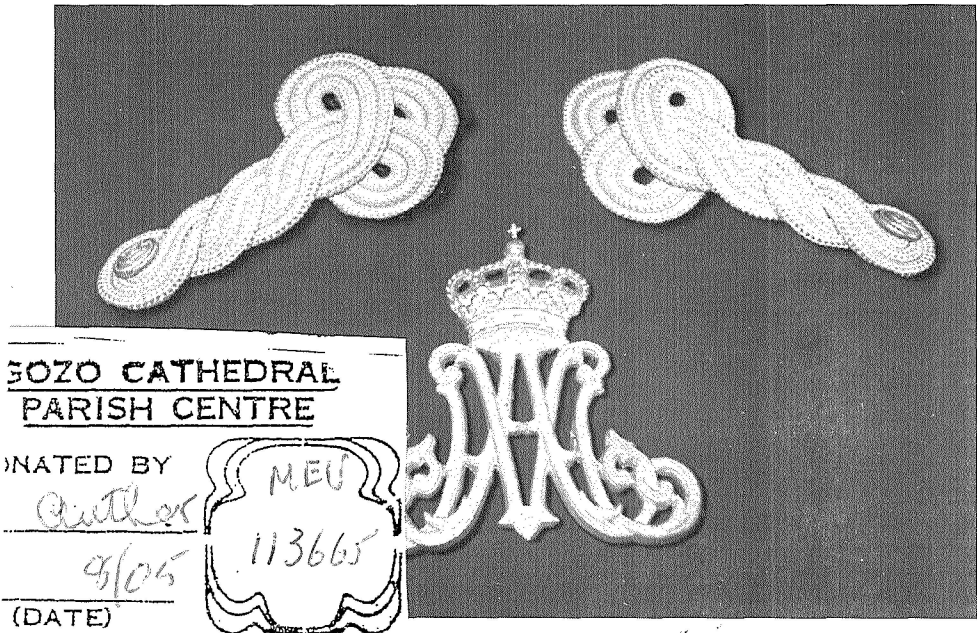
L-ewwel spalletti u l-arma tal-beritta tal-Banda Santa Marija / The first shoulder straps and cap badge of the St Mary Band

The origins and the first years of the St Mary Philharmonic Society of Mosta