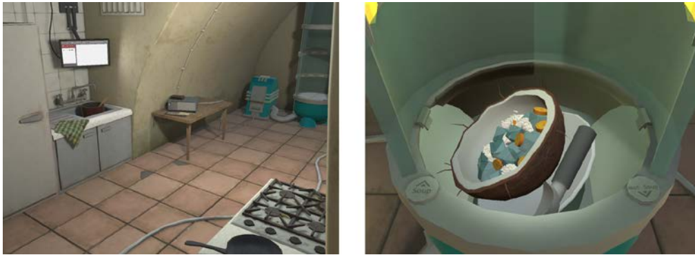
Figure 3: To the left, an overview of the dystopian kitchen of Something Something Soup Something (2017), and to the right an example of a food item in the process of being discarded by the player.

futuristic gameworld, however, food is cheaply produced elsewhere by aliens and teleported to Terra. The conceptual challenge at the core of this game consists in the fact that aliens do not have a clear idea of what humans mean by the word “soup.” Once the aliens send what they think are soups through a teleporting device, players find themselves in the puzzling situation of having to either serve or discard potential soups sent by the aliens with no information to make those decisions apart from their own preconceptions of what can or cannot be considered soup.