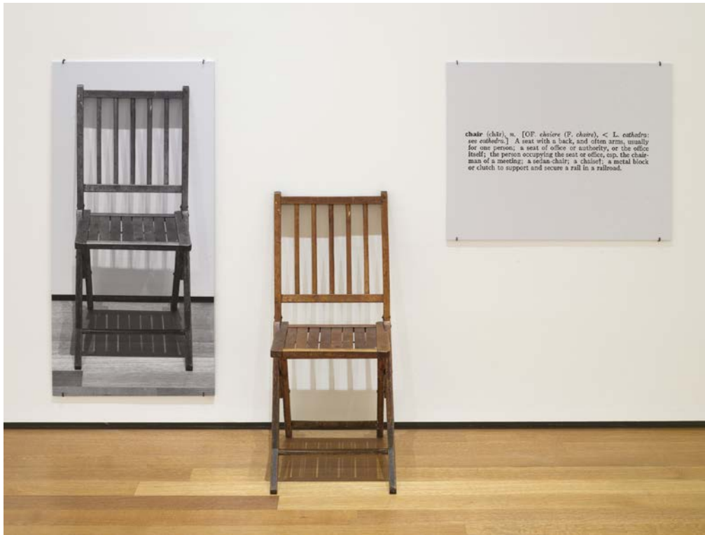
Figure 1: Joseph Kosuth's One and Three Chairs (1965).