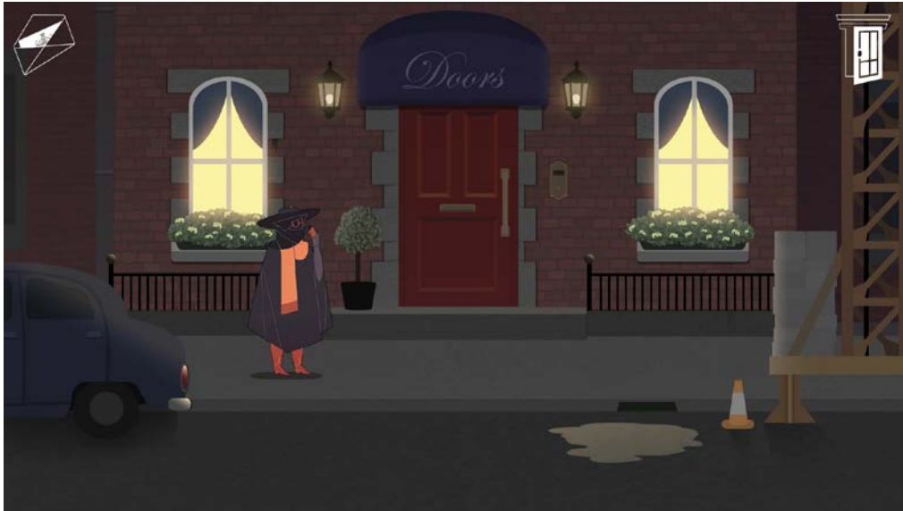
Figure 5: A screenshot of Doors (the game) taken in front of the entrance door to the Doors inn.

This interaction is a good illustration of the cognitive and communicative strategy of Doors : it is an interactive essay that playfully confronts players with paradoxes and troubling questions concerning the representation of eleven in-game doors (see Figure 6). Every one of these questions is preceded by a specific experience of the player, in which they approach the in-game door in a way that they deem appropriate based on their personal game literacy and interpretation of that particular, represented door. Moreover, every door-related question is coupled with references to game studies papers which provide viable answers. The above-mentioned door is linked to Sageng’s (2012) chapter on in-game actions, Matsunaga’s (2016) analysis of what it means when players declare that they perform certain actions within game worlds, and Van de Mosselaer’s (2018) argument that actions performed within videogames are fictional actions.