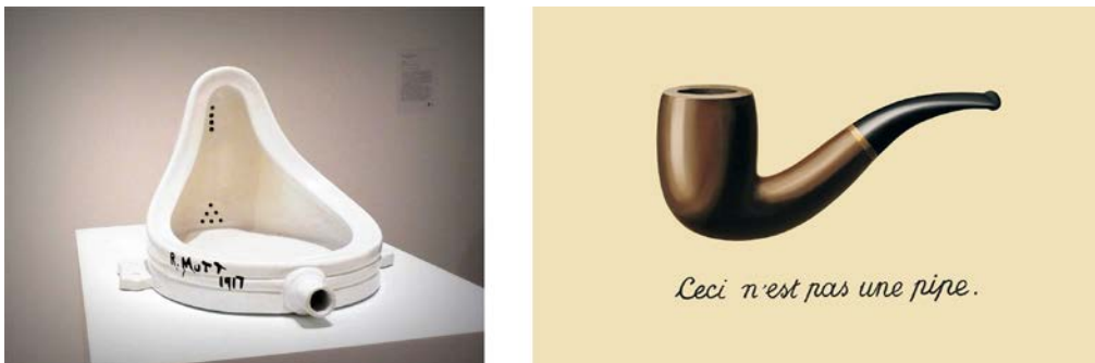
Figure 2: Marcel Duchamp's Fountain (1917) and René Magritte's The Treachery of Images (1929).