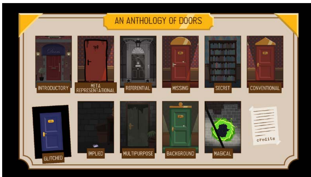
Figure 6: A screenshot of Doors (the game) showing all the kinds of doors that are conceptually addressed in its gameplay.

This interaction is a good illustration of the cognitive and communicative strategy of Doors : it is an interactive essay that playfully confronts players with paradoxes and troubling questions concerning the representation of eleven in-game doors (see Figure 6). Every one of these questions is preceded by a specific experience of the player, in which they approach the in-game door in a way that they deem appropriate based on their personal game literacy and interpretation of that particular, represented door. Moreover, every door-related question is coupled with references to game studies papers which provide viable answers. The above-mentioned door is linked to Sageng’s (2012) chapter on in-game actions, Matsunaga’s (2016) analysis of what it means when players declare that they perform certain actions within game worlds, and Van de Mosselaer’s (2018) argument that actions performed within videogames are fictional actions.