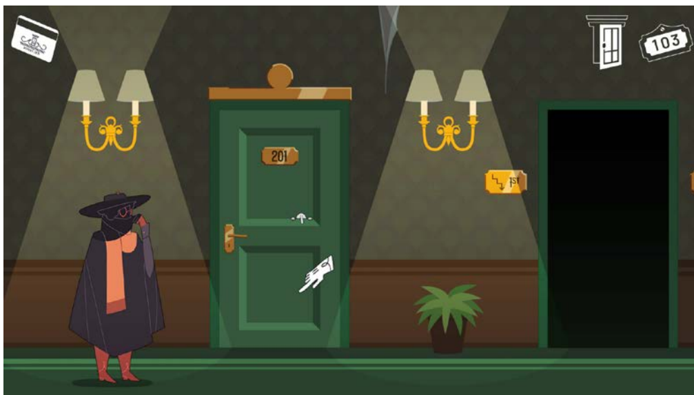
Figure 8: A screenshot of Doors (the game) , showing a futile attempt to perform in-game actions on/with the non-interactive door.

To further show how this tripartite experiential structure allows players to think about a variety of problems and questions regarding the representation of objects within virtual environments, we will analyze two additional doors that can be encountered in Doors . The first door we want to discuss is one that is completely unresponsive to anything the player does. Even though this door looks like all the other, interactive doors in the game, the in-game cursor does not change when hovering over it, not suggesting any action possibilities to players (see Figure 8). Nothing happens when this particular door is clicked on: unlike other doors in the game, it does not open upon player interaction, nor does a message pop up saying that the door in question is locked.