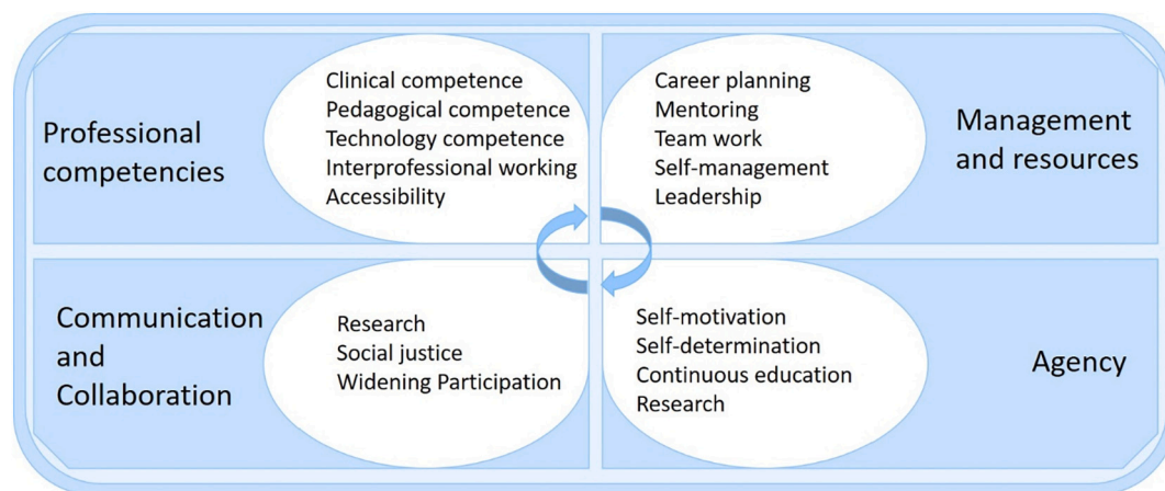
Fig. 2. Thematic analysis of the continuing professional development needs for nurse educators.

competencies (2) management and resources, (3) communication and collaboration, and (4) agency. First, the findings of this review were modelled to represent how the information is themed and clustered (Fig. 2). Modelling in qualitative data analysis is not new (Briggs, 2007) and this approach enabled us to see and describe the wider context of