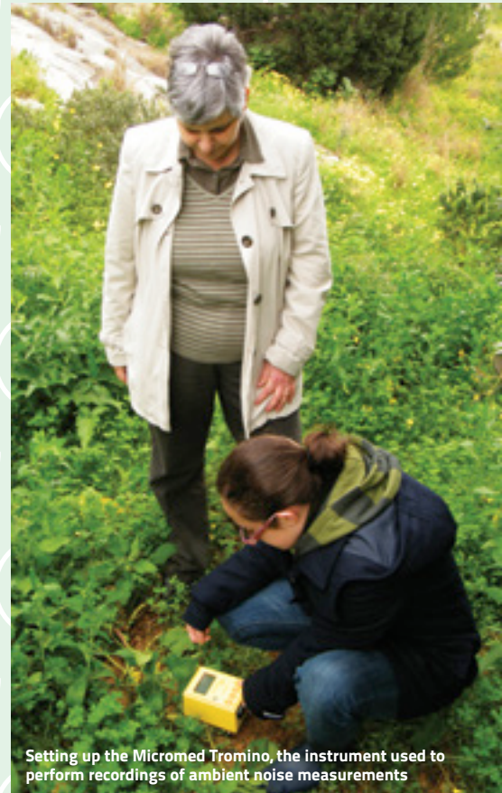
Setting up the Micromed Tromino, the instrument used to perform recordings of ambient noise measurements