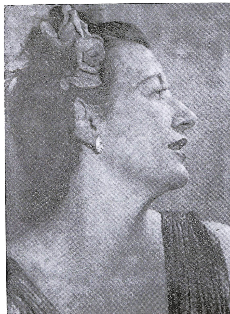
PRINCESS NATHALIE POUTIATINE