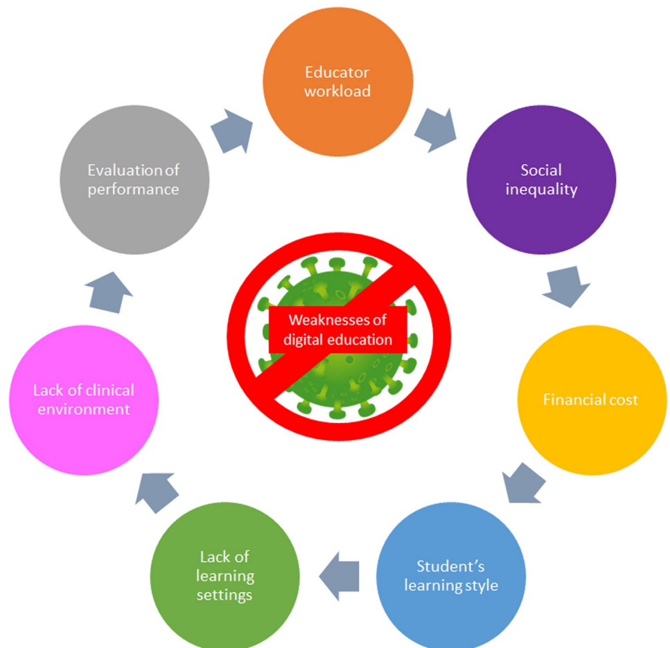
Fig. 2 Weaknesses of digital entry-level education in physiotherapy during COVID-19 pandemic and beyond. Legend: The image displays a graphical summary of the weaknesses of digital education in physiotherapy as emerged from literature [48, 49]

to guarantee all students the same educational opportunities [49]. Such limitations, acting as a source of learning disparities, raise doubts about the sustainability of digital education.