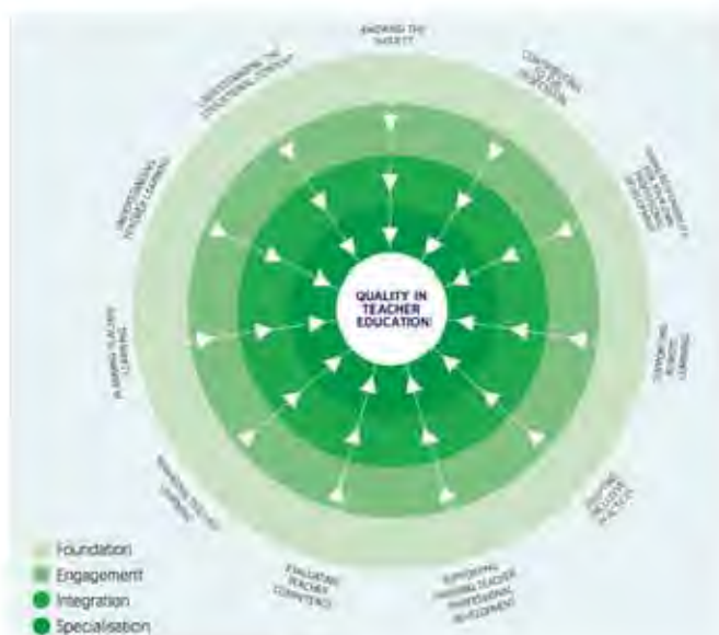
Figure 1: CPD Framework for Teacher Educators