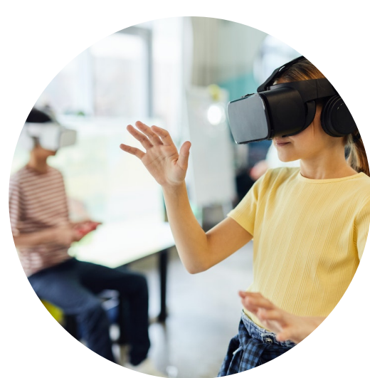
5. Digital Innovation