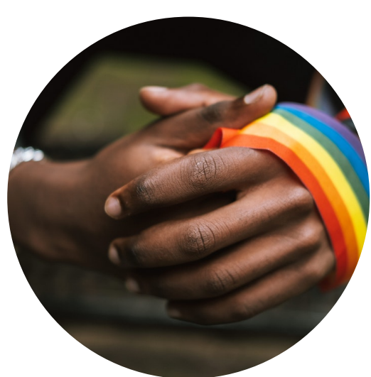
4. Gender, Diversity, Equity & Inclusion