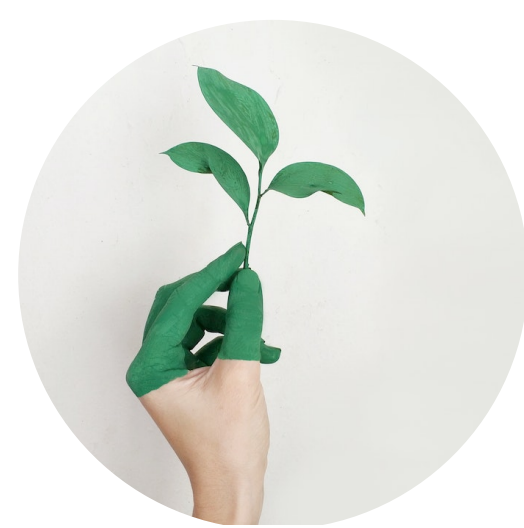
3. Culture and the Arts