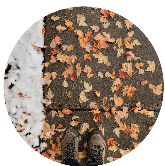
2. Healthy Urban Living