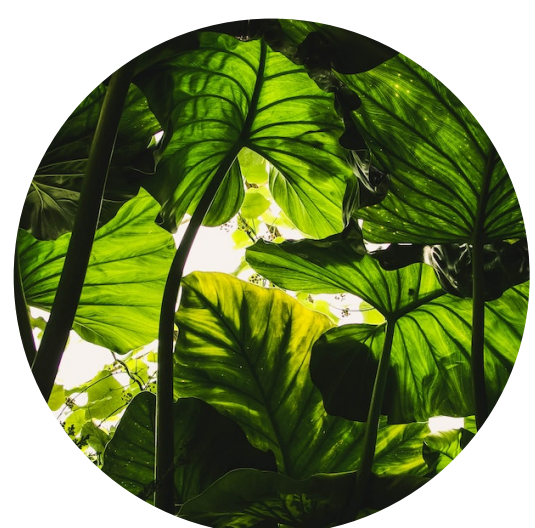
1. Nature-Based Solutions

In a historic UN Biodiversity Conference – COP15 – governments agreed a new Global Biodiversity Framework, which commits them to deliver "urgent action to halt and reverse biodiversity loss" to "put nature on a pathway to recovery" by 2030. This was a momentous agreement, including global consensus from 196 countries to protect 30% of land and sea, cut environmentally harmful subsidies and increase finance flows for protecting and restoring nature. This new set of biodiversity targets for the next decade through Convention on Biological Diversity puts urban environment in the forefront of climate and nature actions.