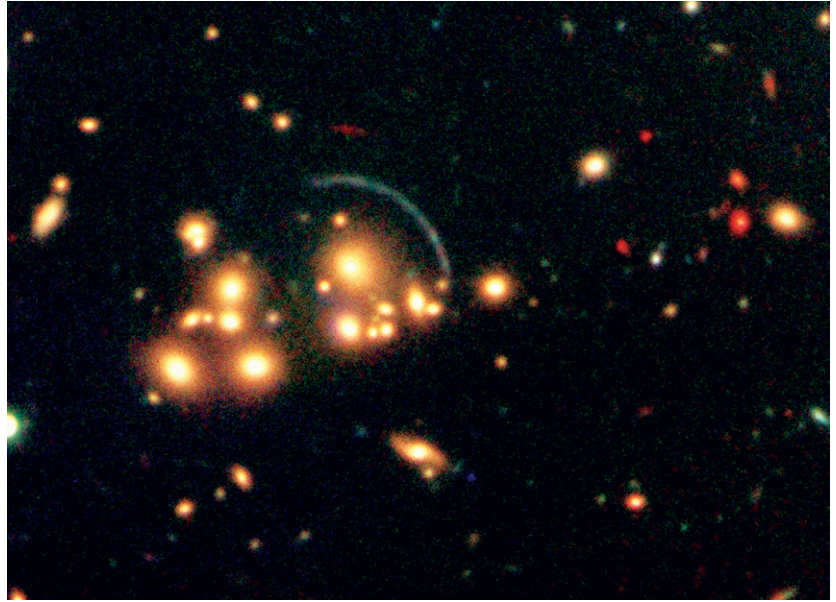
A colour composite image of the galaxy cluster CL2244-02 obtained with the VLT Test Camera at the UT1 Nasmyth focus. In addition to the prominent blue arc, produced by gravitational lensing of a galaxy, there are also notable, very red arcs, both closer to the centre and further out. They were only detected in the infrared image and are probably due to lensing of a much more distant galaxy.

Once we have extracted a catalogue of stars in our image, what's next? Stars are usually circular or elliptical in shape, so if we look at the stars and see that they are a different shape we know that in that area of the image there are certain secondary effects and distortions. The amount of secondary effects is not uniform and an image is degraded by different amounts and directions across it—called spatial variation. A good image needs a large number of spread out stars to model the degradation properly.