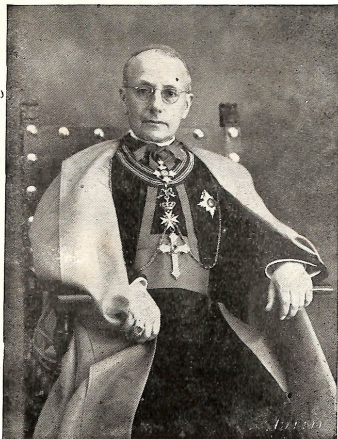
HIS GRACE MGR. SIR MICHAEL GONZI.

D.D., B.Lit., B.L.Can., J.C.D., (Greg.), LL.D., (Hon. Causa),