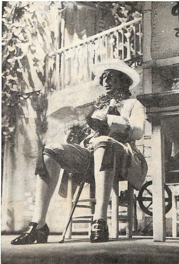
ERNESTO CALINDRI ne "IL VENTAGLIO", di Carlo Goldoni.