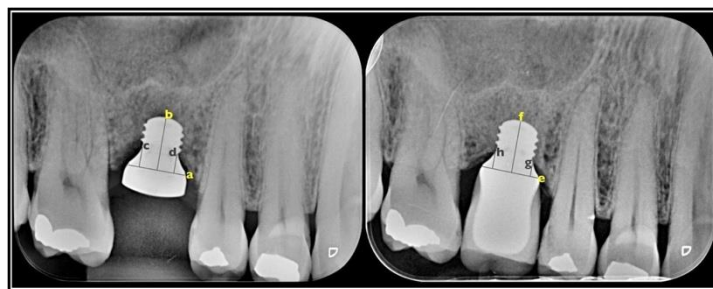
Figure 1. Radiographic assessment of marginal bone loss. (a) Implant platform line on immediate postoperative periapical radiograph. (b) Implant length on immediate postoperative (PO) clinical exam (perpendicular line from implant apex to prosthetic platform line). (c) Distal measurement from the most coronal bone/implant contact point