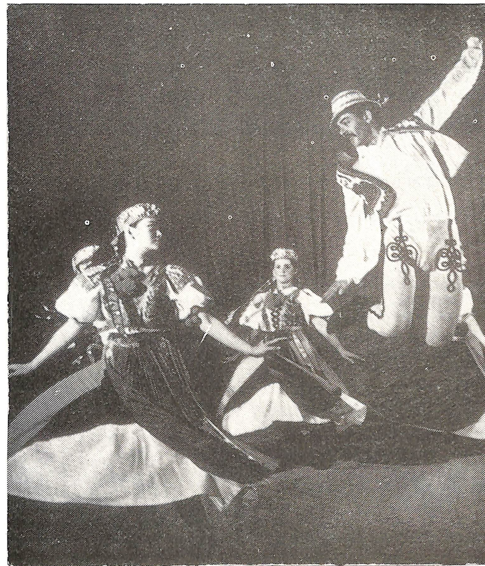
The Hungarian Folkloristic Group "Erkel Ferenc" in Malta