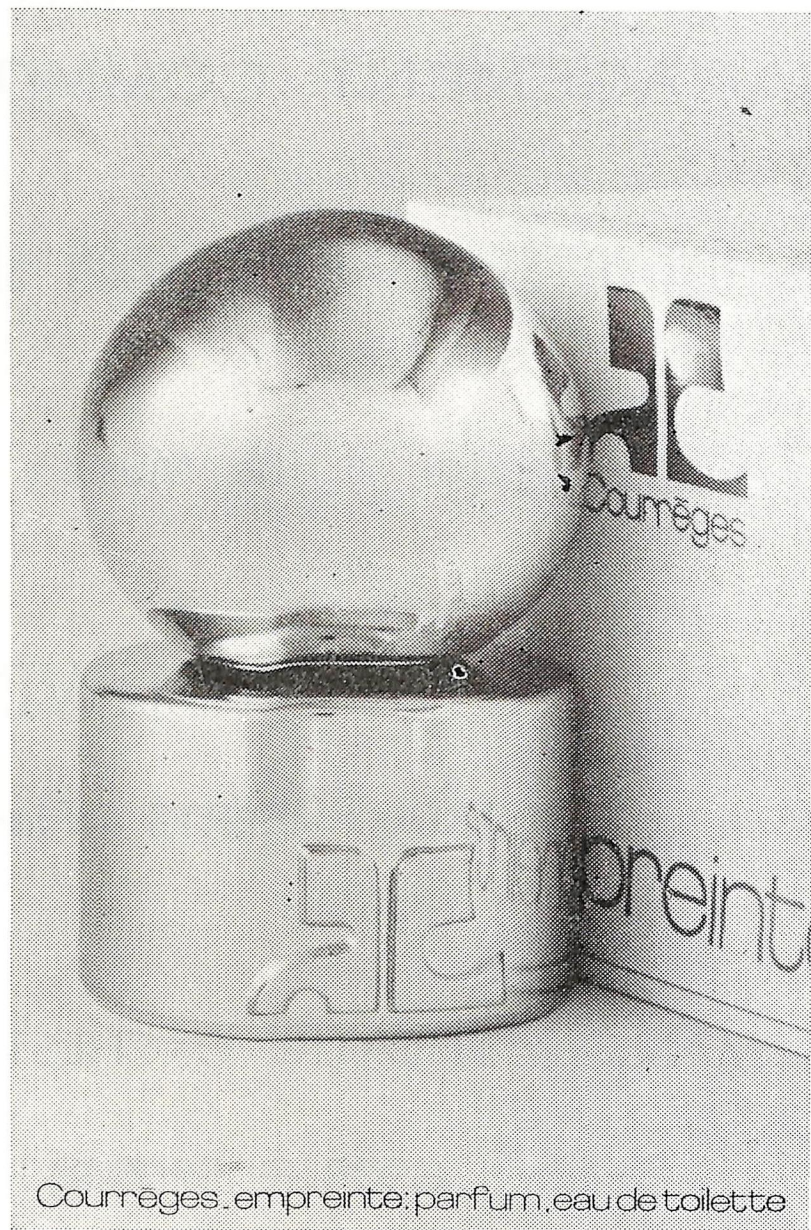
Courmèges empreinte: parfum, eau de toilette