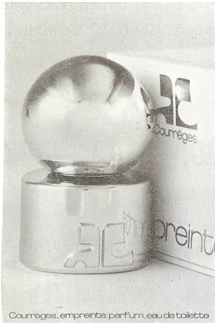
Courmèges. empreinte: parfum, eau de toilette