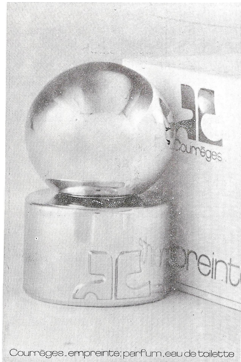
Courmèges. empreinte. parfum. eau de toilette

X'ser jagħmel is-Sultan Arelqemel meta jaf li dak kollu li ngħad fuq Salomè ma kien veru xejn? U x'ser jagħmel Tullju Kassju meta jiskopri l-ħrafa?