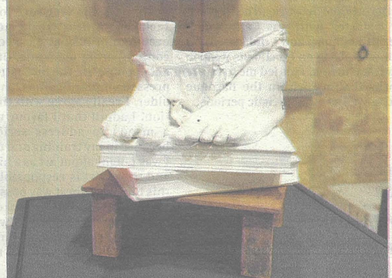
Do I Have Your Attention Now? by Etienne Farrell

The exhibition contains bas-relief, mid-relief and high-relief works including also an interactive composition. Free-standing, large and imposing all-in-the-round sculptures stand next to smaller delicate creations. Some artists seem to have created their sculpture in