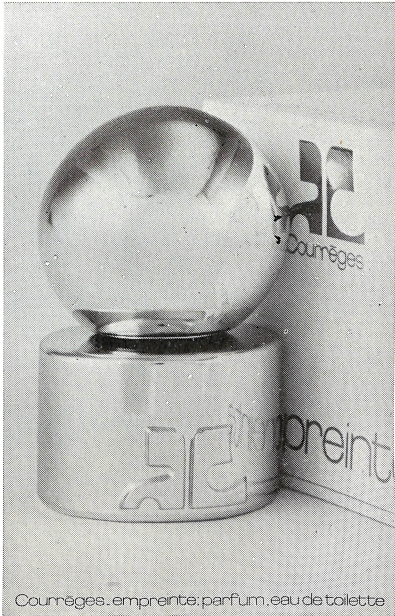
Courrèges. empreinte. parfum. eau de toilette