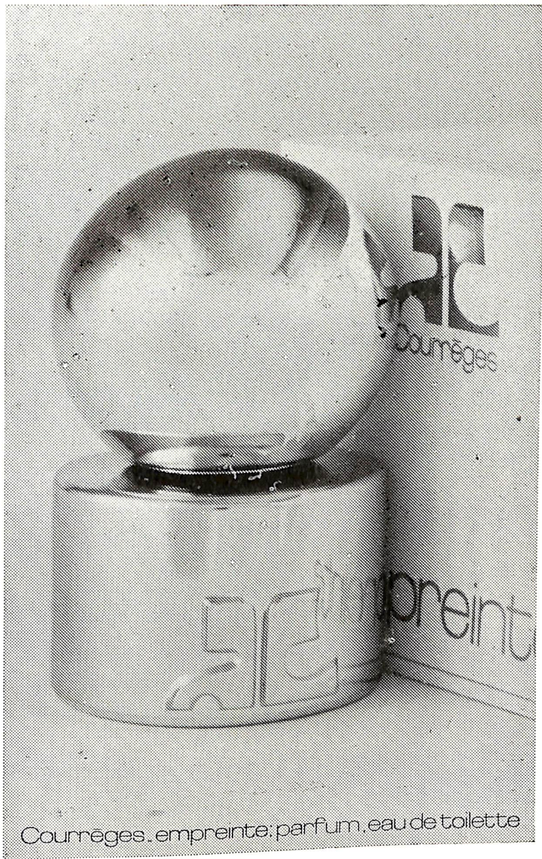
Courmèges empreinte: parfum, eau de toilette