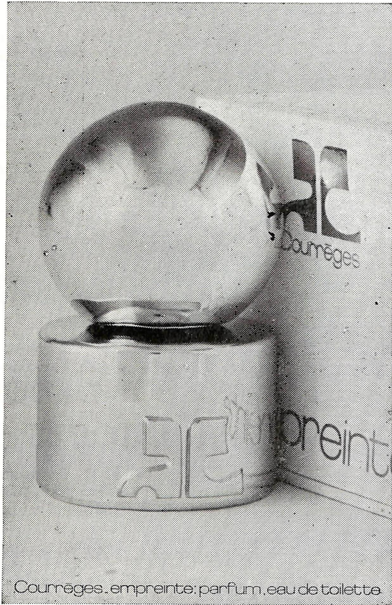
Courmèges. empreinte: parfum, eau de toilette