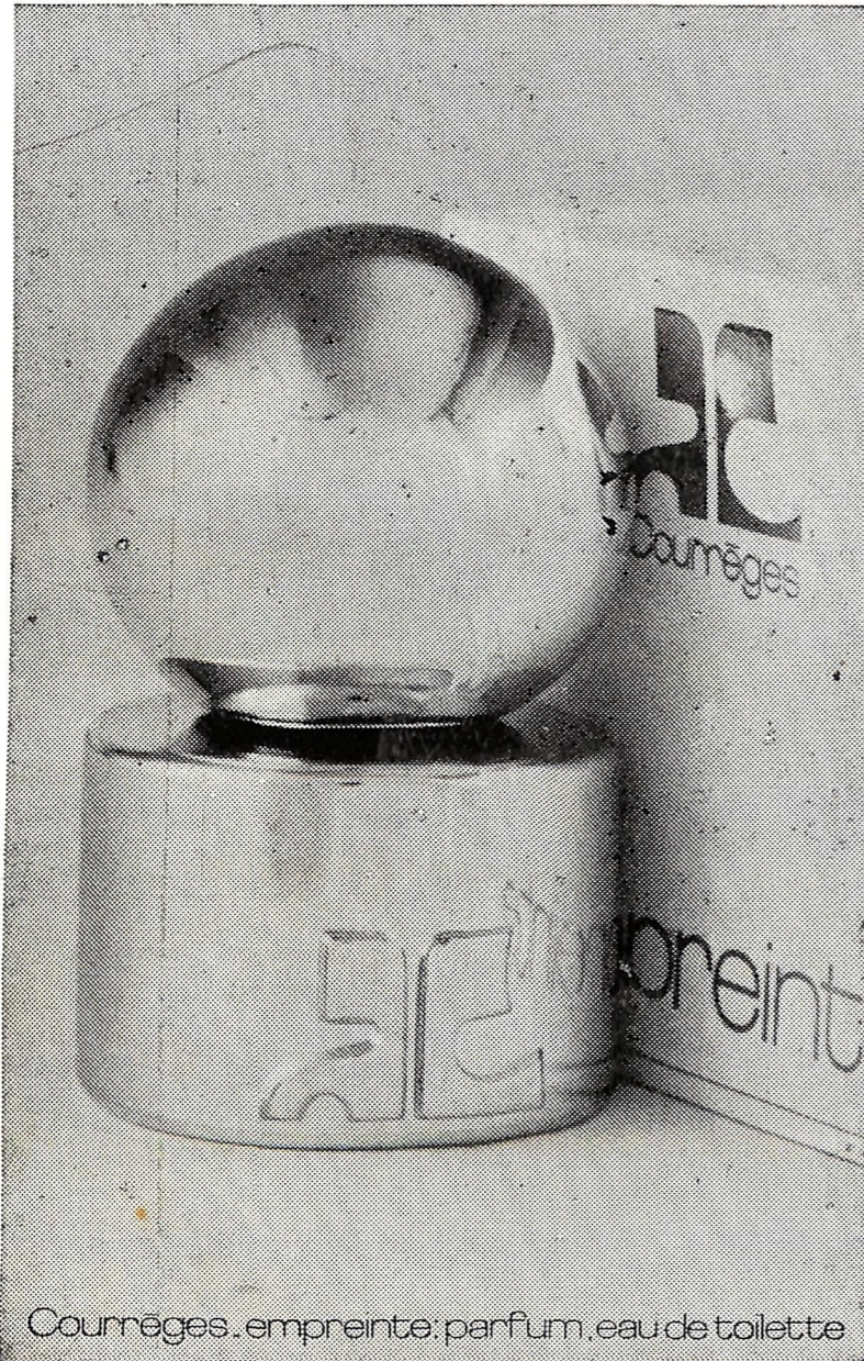
Courrèges. empreinte: parfum, eau de toilette