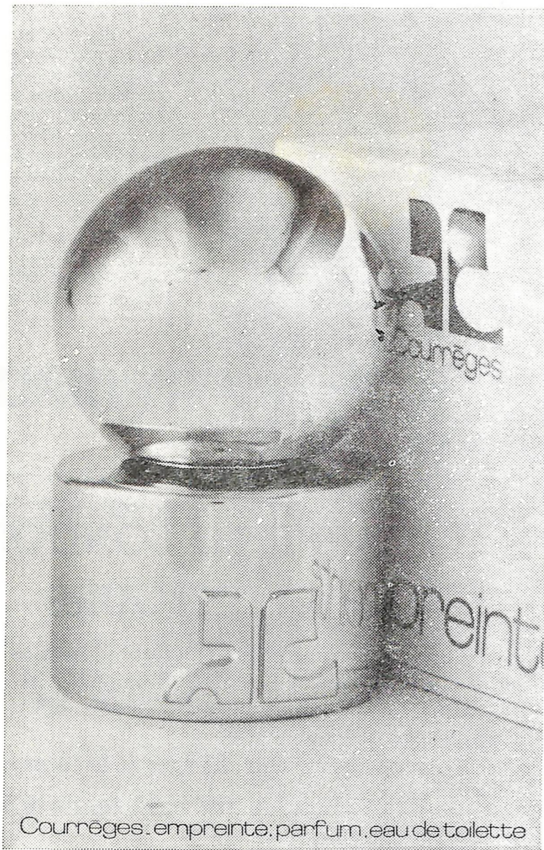
Courmèges. empreinte. parfum. eau de toilette