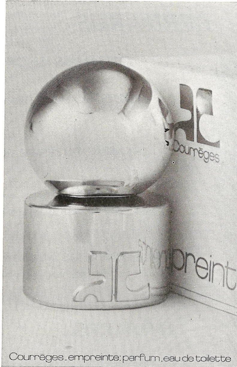
Courmèges. empreinte. parfum. eau de toilette