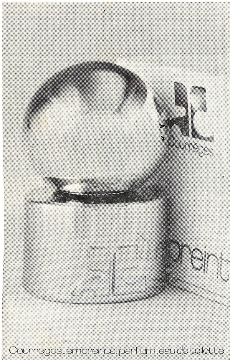
Courmèges. empreinte. parfum. eau de toilette