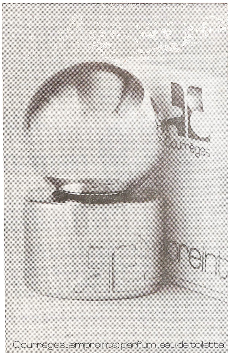
Courmèges empreinte: parfum, eau de toilette