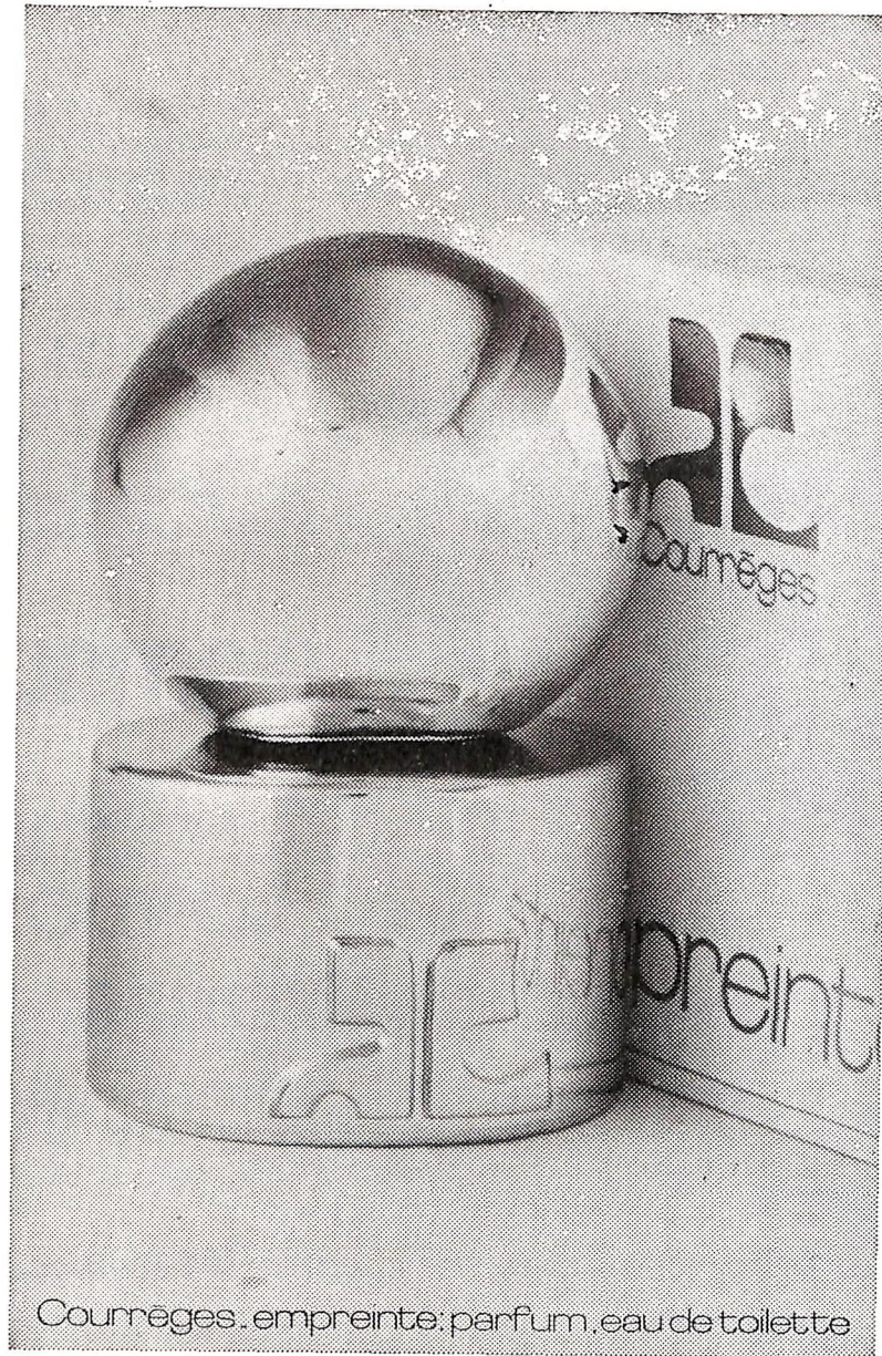
Courmèges. empreinte. parfum. eau de toilette