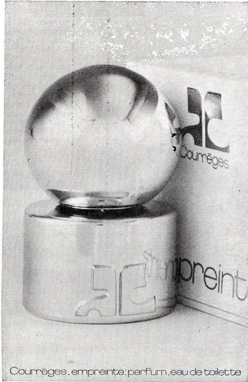
Courreges. empreinte. parfum. eau de toilette