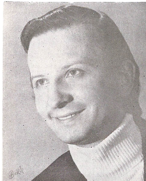
Tenor: GAETANO SCANO