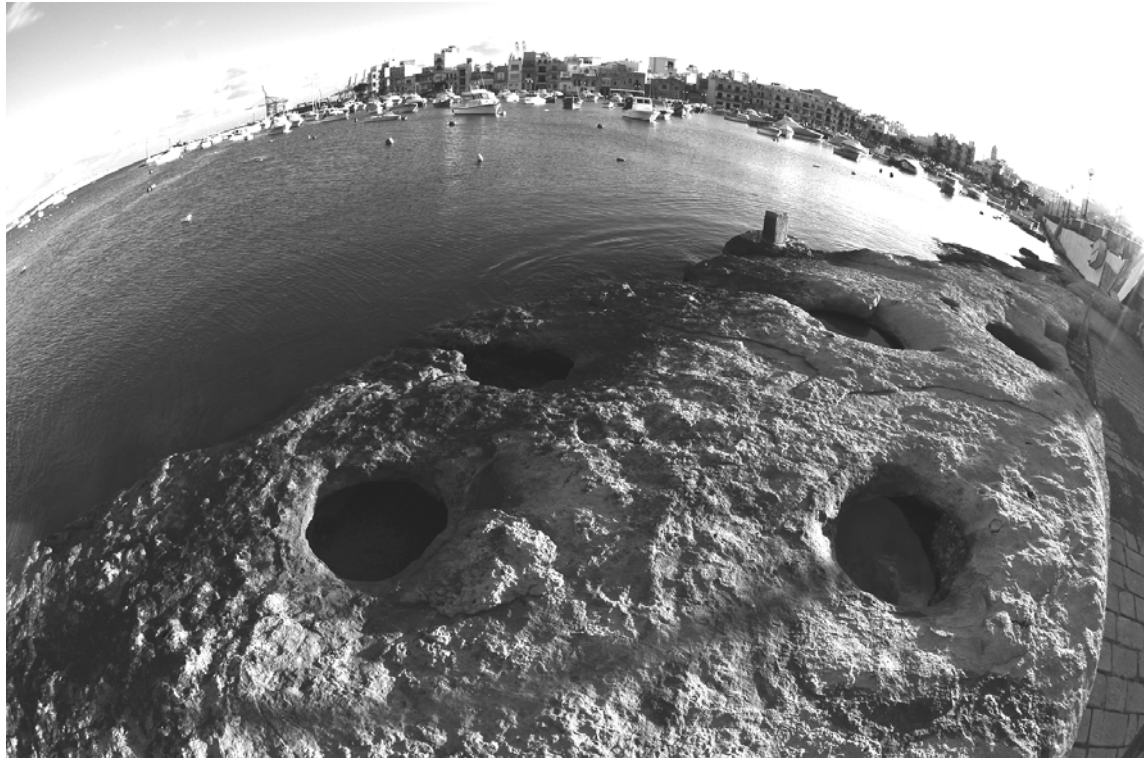
Fig. 2, The pits at St. George's Bay, Birzebbugia, S Malta.

Le strutture archeologiche presso St. George's Bay, a Birzebbugia, nella parte meridionale di Malta.